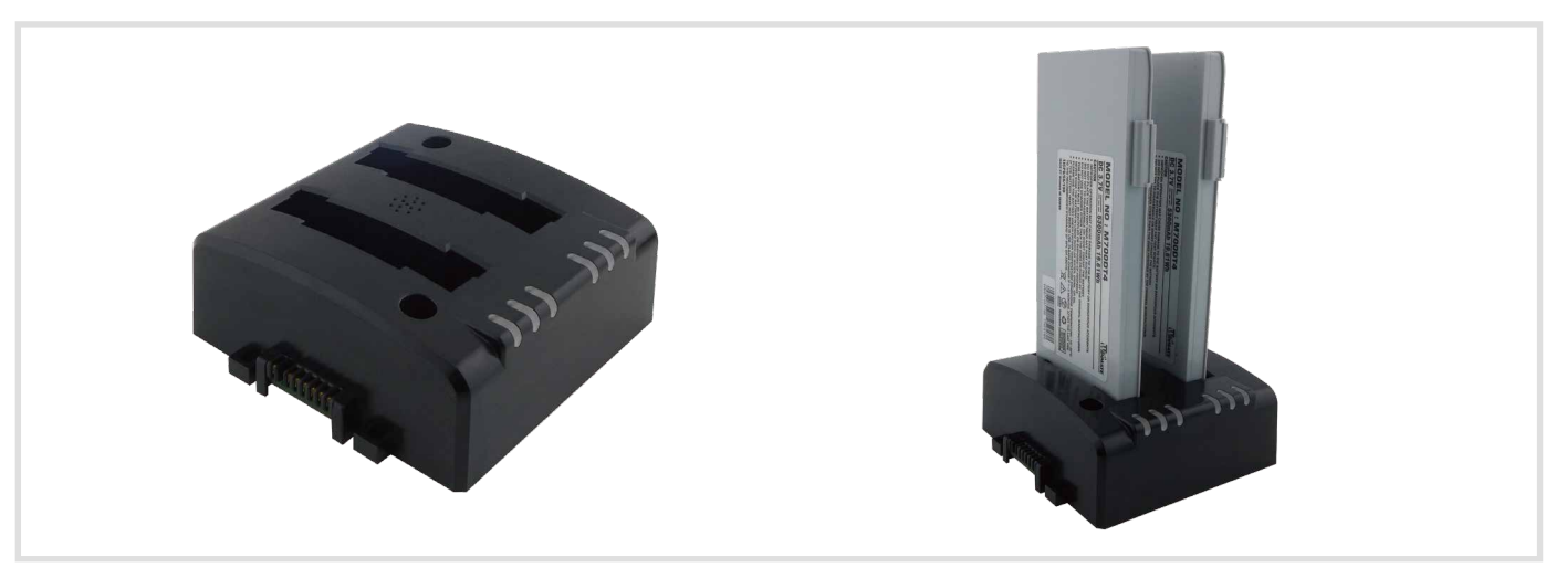
Buzzer to indicate when user insert the battery or alert user for any errors on the battery